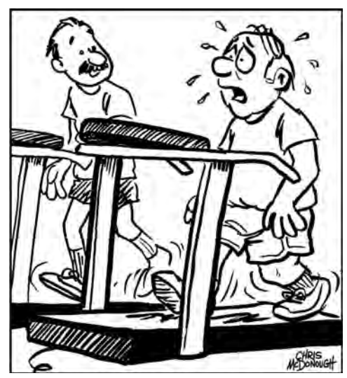
"Sometimes I feel Jesus' biggest miracle was the he got around everywhere without using a car!"

Tuesdays - 6:00 PM to 7:00 PM (Church) Monday through Friday - 11:00 AM to Midnight (Holy Family Chapel)