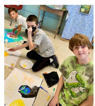
Junior high students participated in World Drawing God Day! Thinking about their faith and love of God, students used different media to express their feeling about God.