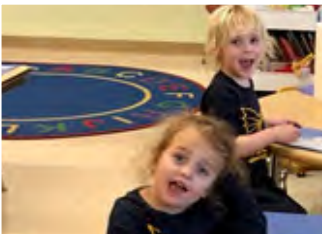
Saint George PreK made their own "snow fun," even if there was no snow outside!