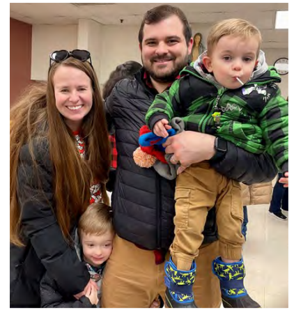
How wonderful to see the second generation of families attending St. George School - Children of some of our graduates from the 1990's!