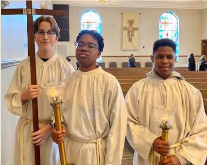
Each Friday during Lent, the eighth graders led all students in praying the Stations of the Cross.