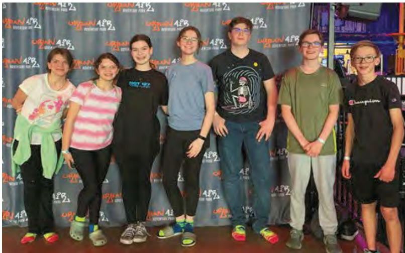
Our teens enjoyed our time together at Urban Air!

Junior High Students are invited to hang out with us on Thursday, May 4 from 3:00 PM to 5:00 PM at Saint George Church.