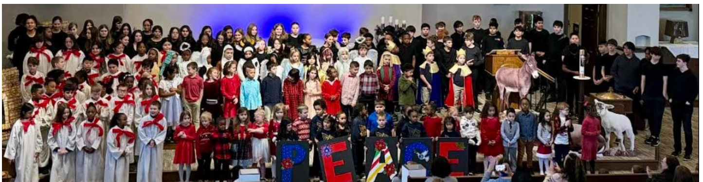
Our students did a phenomenal job celebrating the real reason for the season. Happy birthday Jesus!