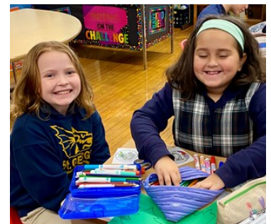
Second and fifth graders worked together creating ornaments for the Jesse Tree.