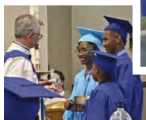
Saint George Graduation 2023. May God bless our graduates!!