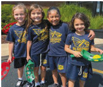
First, second, third, and fourth graders shared an enjoyable recess on a beautiful day!