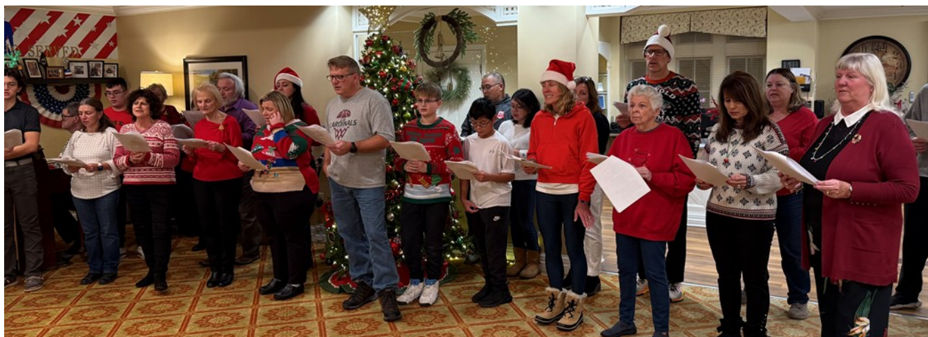
Caroling at Brookdale Assisted Living Center in Tinley Park