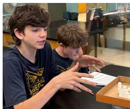
Eighth graders used sugar cubes in their study of building design as part of the unit on earthquakes.